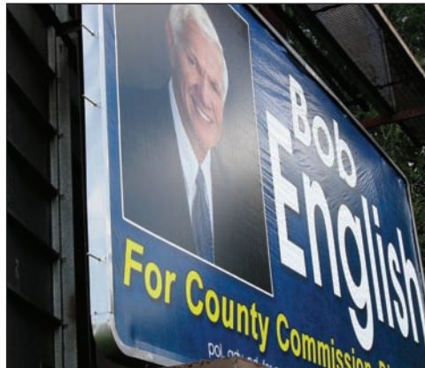
Close up of corner and side of Retro post