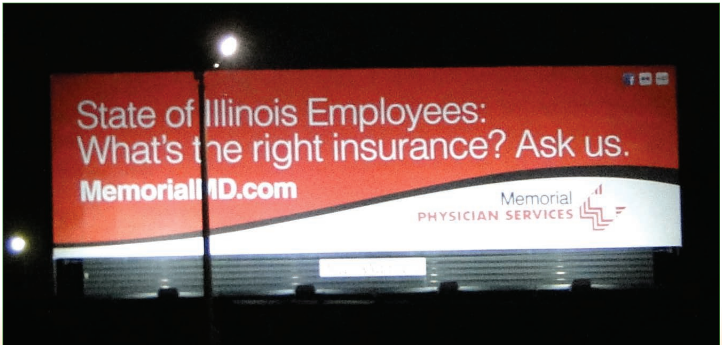
14' x 48'

NOTE: Colors and levels of photos were not manipulated