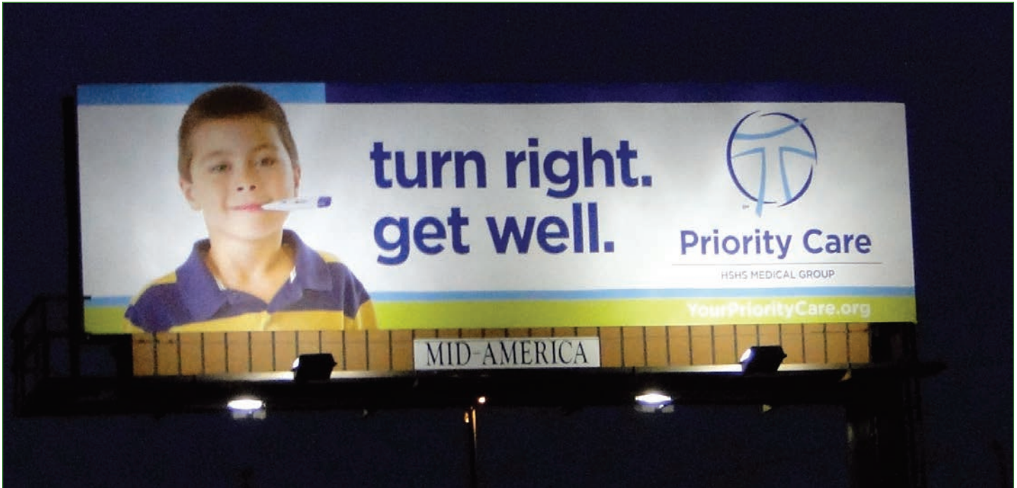
10' 6" x 36'