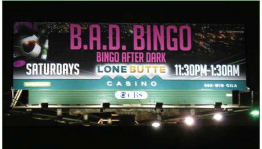
14' x 48' utilizing ShineVue LED™ inside Holophane Sign-Vue™ fixtures