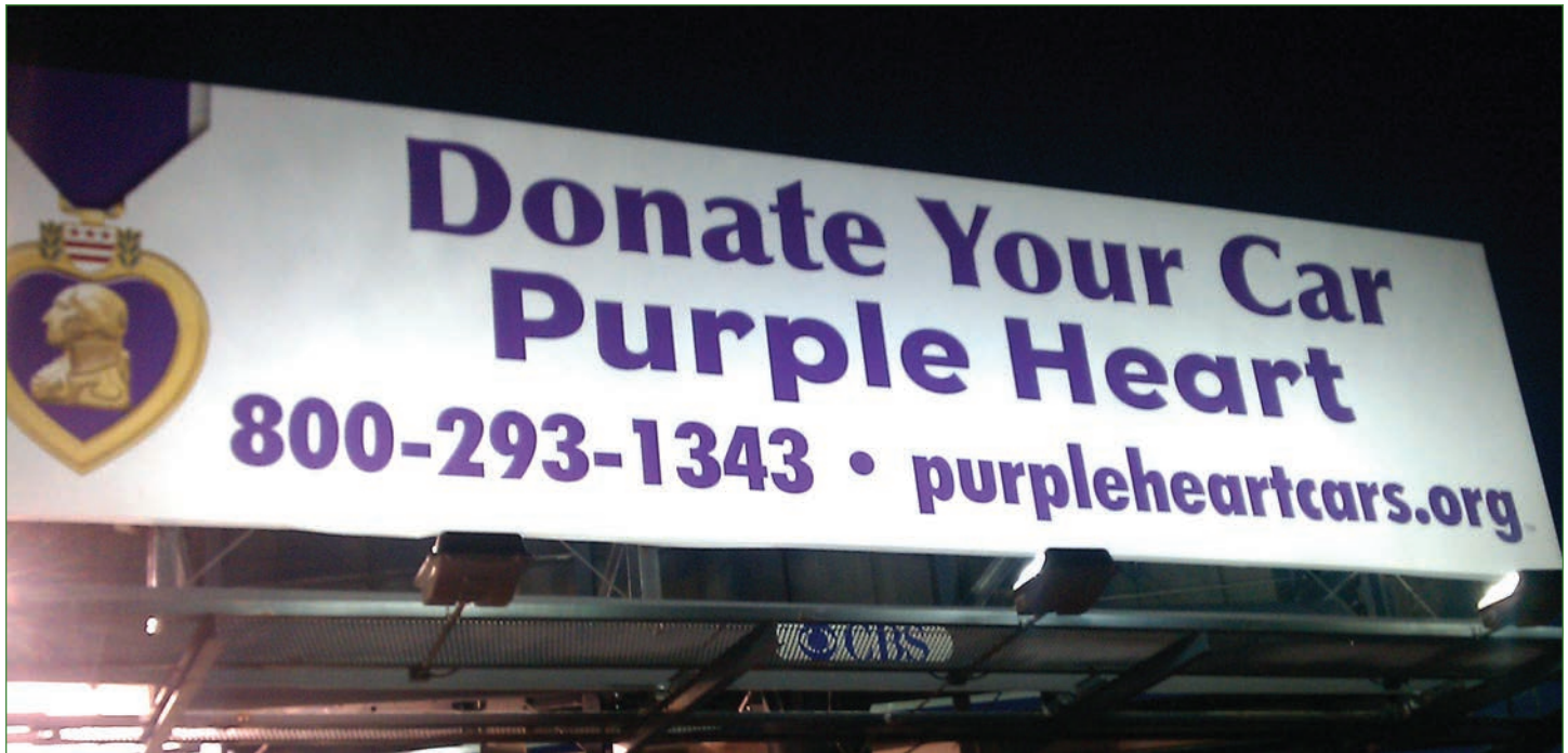
10' 6" x 36'