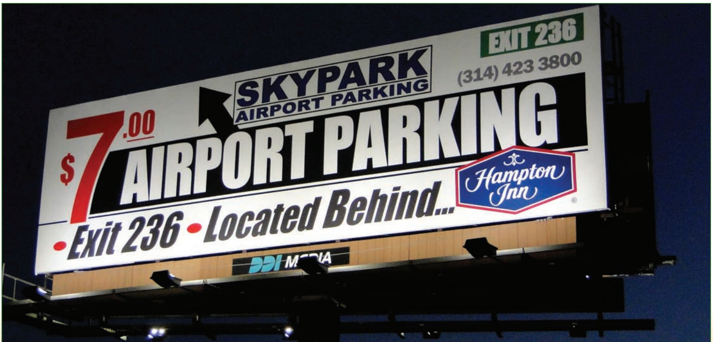
14' x 48'

NOTE: Colors and levels of photos were not manipulated